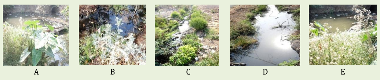
Figure 1: Sampling Sites in MIDC effluent streams – (A) Alocasia sp. (B) Argemone mexicana (C) Croton teglium (D) Cyperus sp. (E) Sonchus oleraceus.

For the experimental set of Argemone mexicana Linn. it appears that pollen germination was moderately inhibited in the media contaminated with the Cadmium (Cd) and has less inhibition in the Mercury (Hg) contaminated media but germination was more inhibited in the Zinc (Zn) contaminated media (Fig. 3).