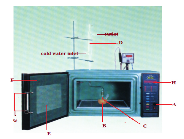
A. Power and Time Control PanelC. Magnetic StirrerE. Observation WindowG. Safety Interlock System

B. Round Bottom FlaskD. Refluxing Condenser UnitF. Door AssemblyH. Display Unit