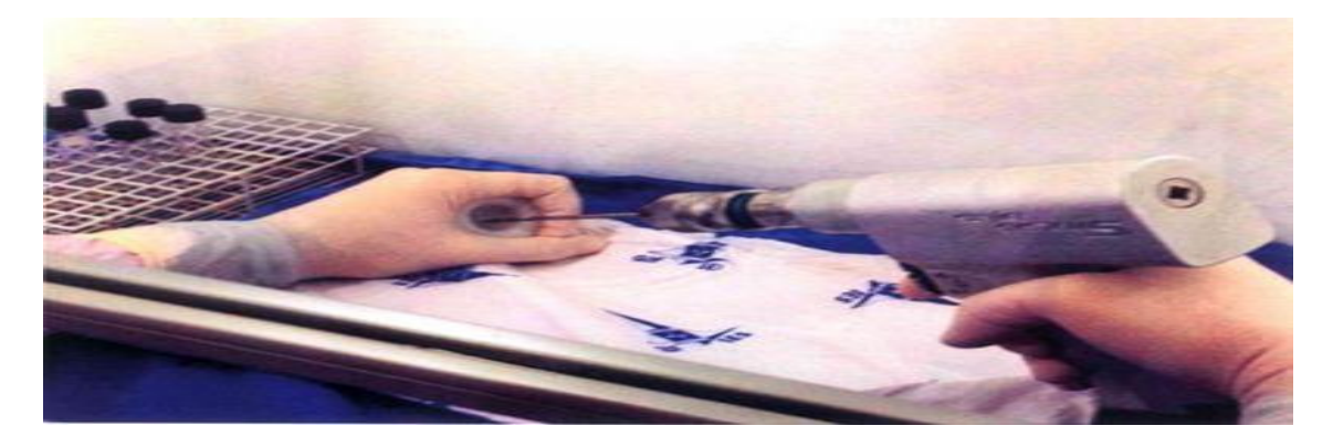
Figure 2. Collection of material from the deep layer of the polyethylene acetabular component (second phase).

This phase was held in an aseptic chamber, cleaned and further sterilized by UV light of 260 nm wavelength, for an hour. During the completion of all trials, good laboratory procedures were followed to minimize the risk of contamination. The opening of the package containing the UHMWPE acetabular component was accomplished with the aid of sterile forceps and scissors. To test deep layer sterility, material collection was made by drilling the polyethylene acetabular component's deep layer with the aid of an orthopedic surgical drill and a 3.0 mm drill bit previously sterilized (Figure. 2). The drilling was held on the inside of the concave region of the acetabular component and spanned its entire thickness.