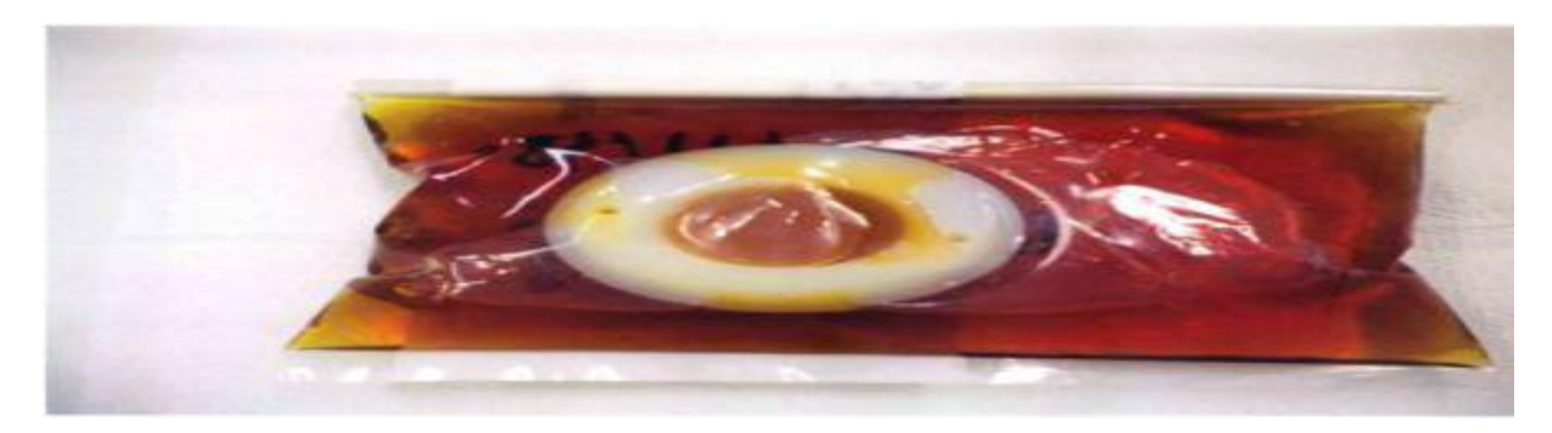
Figure 1. Incubation of polyethylene acetabular component in Trypticase Soy Broth (first phase).

Broth sterility control was performed by incubating, under the same conditions, packaging containing the broth, but without inoculation with the acetabular components. On day 10, visual observation, phase contrast microscopy, and Gram stain were made in order to find any possible bacterial growth.