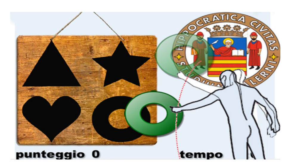
Figure 3: Layout of the module.

PROBLEMS OF EDUCATION IN THE 21st CENTURY Volume 42, 2012 34