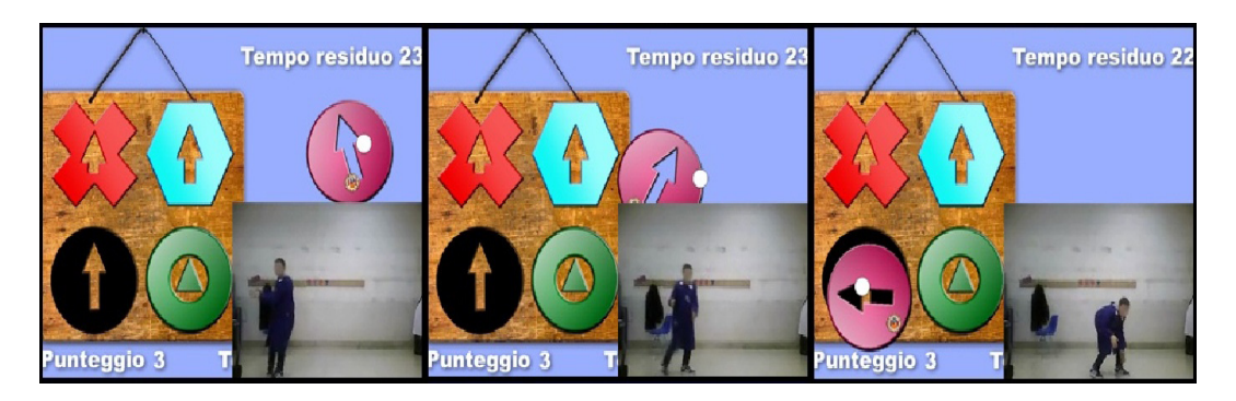
Figure 4: Screen and video captured frames.