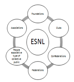
Figure 2: Organizations addressed the ESNL.

Therefore, entities such as Private Institutions of Social Solidarity (IPSS), corporations and associations of firefighters, football clubs, sports and cultural associations, among others, that do not adopt the International Accounting Standards (IAS) should be prepared with the resources necessary to meet the challenge of adopting new accounting regime of ESNL. Its financial services are going to have Chartered Accountants (TOC) empowered to implement and execute this new accounting or accounting framework, then, professional services to external entities in order to respond adequately to the requirements of accounting and financial reporting they now stand, following the entry into force of the Standard Accounting and Financial Reporting for the non-profit sector entities (NC-ESNL), as exemplified in the Figure 2: