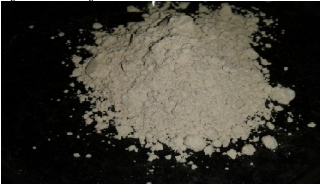
Fig. 9: Kushta Abrak Safaid