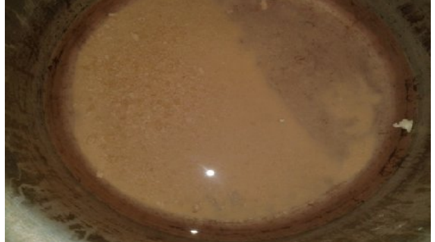
Fig. 8: Kushta being dried on heater