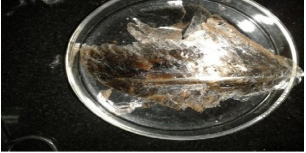
Fig. 1: Raw Abrak

The layers of raw abrak (Fig. 1) were first separated by pounding it in a mortar. The small pieces of abrak were then kept in a bag of thick cloth along with date seeds ( Phoenix dactylifera ) and tied (Fig. 2). The bag was then dipped in hot water and rubbed vigorously with both hands. Small particles of abrak were then squeezed out of the bag. The process of dipping the bag in hot water and rubbing was repeated till all the particles of abrak were allowed to settle down at the bottom of the vessels and the water was decanted. Abrak particles were removed and dried. These particles are abrak mehloob or abrak dhanab (Fig. 3). <sup>[10-13]</sup>