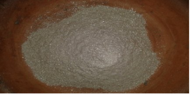
Fig. 3: Abrak after dhanab