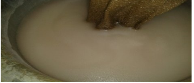
Fig. 2: During Dhanab