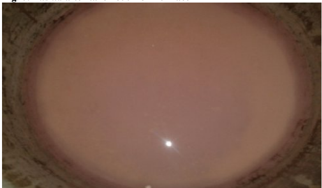
Fig. 7: Kushta dipped in water

IJPSDR July-September, 2013, Vol 5, Issue 3 (129-132)