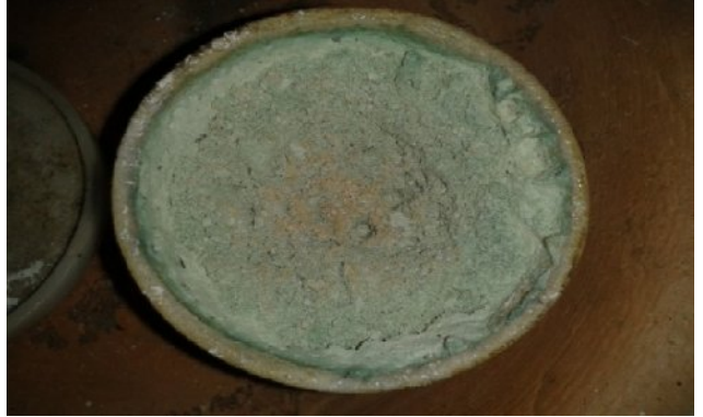
Fig. 6: Kushta after taken out from furnace