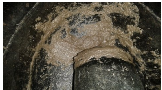
Fig. 4: Abrak triturated with aab mooli

sunlight for 1 day. The heating was done as given by Parmar et al. <sup>[14]</sup> The peak temperature maintained was 1008°C at 35 \pm 5 minutes, above 800°C temperature was maintained for 20 \pm 5 minutes and above 600°C temperature was maintained for 40 \pm 5 minutes. After removal from furnace (Fig. 6) it was dipped in 11itre water (Fig. 7) so as to remove the quantity of shora qalmi . Subsequently kushta was dried on electric heater (Fig. 8). After drying the finished product i.e. kushta abrak safaid (Fig. 9) was stored in an air tight bottle.