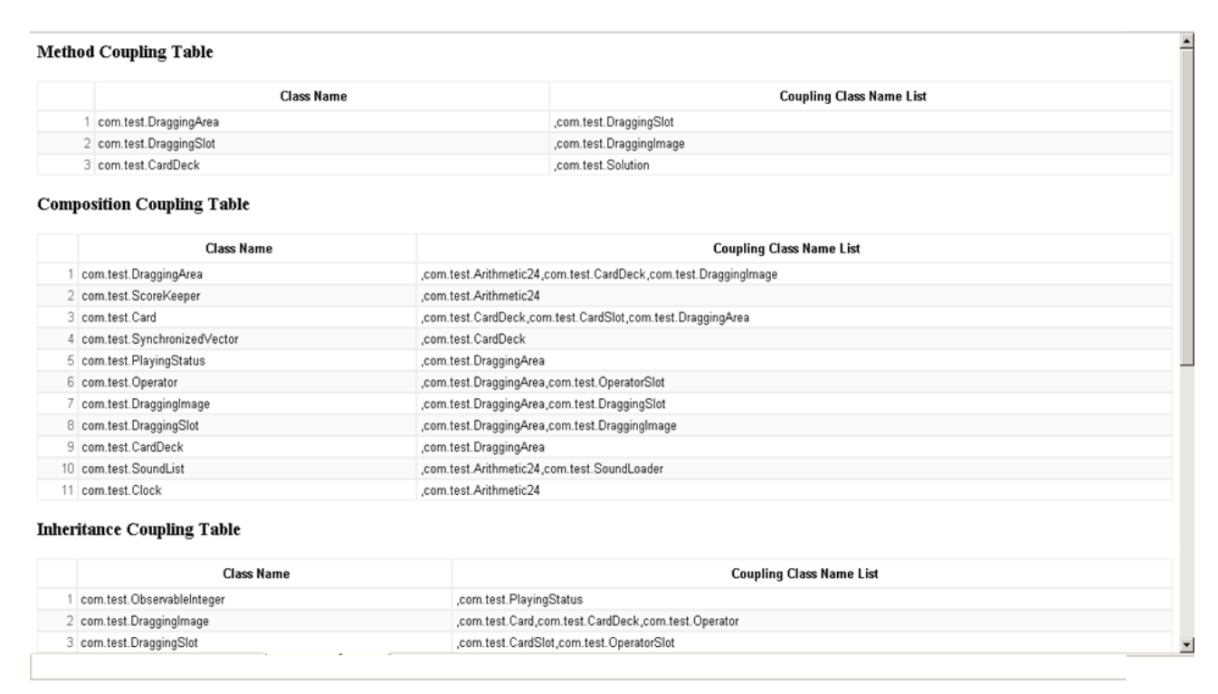
Fig. 3- Method, Composition, Inheritance Dependency identified from our tool of Arithmetic24 Game software