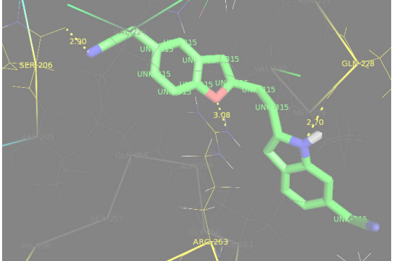
Fig. 3- Interaction of NU-126 with MKP 1

Genetic algorithm was performed for 50 runs .The dock log file shows that the ligand docked with the Mitogen activated protein kinase phosphatase 1 with the lowest energy -7.07 kcal/mol (run 25) and shown rank 1 in the Clustering Histogram table. Interaction of NU-126 with MKP 1 shown in figure 3, and the hydrogen bond donor, acceptor and distance profile are mentioned in table 2.