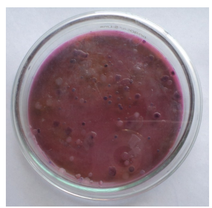
Fig. 1- Microbial colonies on Eosine Methylene Blue Agar plate (Raw milk sample)