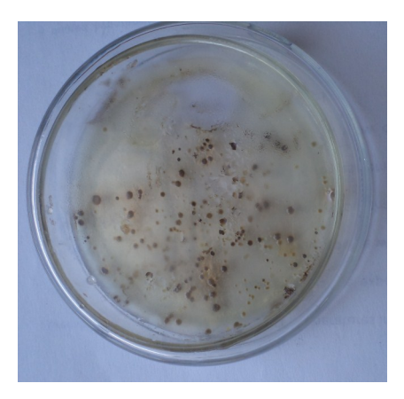
Fig. 3- Microbial colonies on Bismuth Sulphite Agar plate. (Raw milk sample)