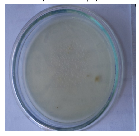
Fig. 4- Microbial colonies on Bismuth Sulphite Agar Plate. (Pasteurized milk sample)