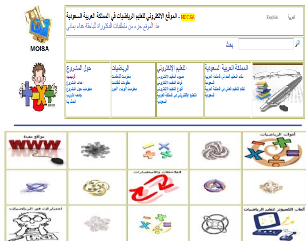
FIGURE 1 THE WEBSITE FRAME IN ARABIC

One of the critical parts of this research was the development of the e-learning website that served as the venue for students to learn mathematics. The website designed in this study—Mathematics Online in Saudi Arabia (MOISA)—allowed the students to learn mathematics at their own pace in their own time, with a flexible, interactive and engaging online experience (see Figure 1) .