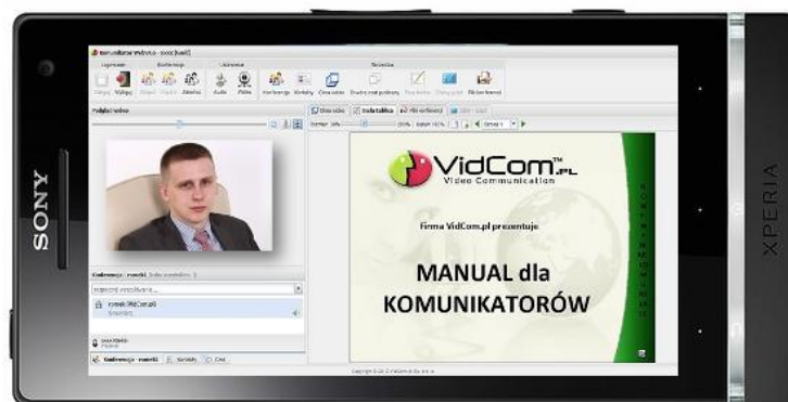
Figure 2. Videocommunicator in Android version (via Internet browser)

As an answer to client's needs the e-VideoHelpDesk system was implemented as a cloud computing, with functionality additionally extended to smartphones with implemented communicator for Android system.