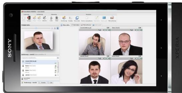
Figure 3. Videocommunicator in e-VideoBusiness version

As an answer to client's needs the e-VideoBusiness system was implemented in server version (the whole of software within client's internal IT structure), with functionality additionally extended to smartphones with implemented communicator for Android system.