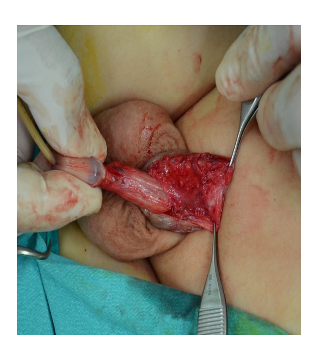
Figure 2 . After degloving, fibrous tissues released to obtain proper alignment of the corpus.

catheterization. No obvious cordee was observed but 90 degree counterclockwise penile torsion was observed. In order to prevent possible iatrogenic fistula formation, hydro-dissection was performed in previous surgical sites and dissection was performed at the level of the Buck fascia. After total degloving, the pedicle of the previous preputial island flap and residual fibrous tissues were released to correct the penile torsion deformity and full correction established (Fig. 2).