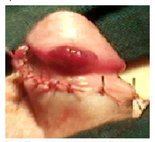
Fig.1. Hemangioma on glans of the penis In the histopathological examination of the lesion, there were large blood vessels

A 9 years old boy with red swelling on the left side of glans penis was admitted to our clinic with the desire of circumcision. His parents had noticed a bright red spot resembling a cherry on glans penis, but instead of regressing, it had gradually increased in size and volume since his babyhood. On physical examination, there was about 7 millimeters of hemangioma on glans penis that was discolored when pressed on (Fig.1). The lesion was totally excised during circumcision under general anesthesia. There was no abnormal scarring or disfigurement at the lesion site on follow up.