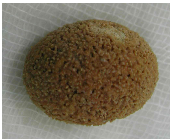
Fig. 2. A elliptical bladder stone was extracted by open vesicolithotomy.

Broad-spectrum parenteral antibiotics were given according to culture sensitivity, and the patient underwent open cystolithotomy. An elliptical bladder stone was delivered smoothly (Fig. 2).