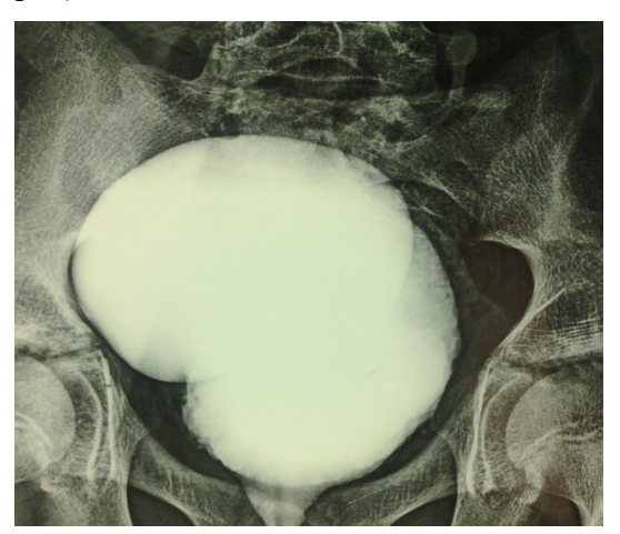
Fig. 1. A voidingsystourethrogram showing a posterolateral giant bladder right diverticulum.

cystouretrography (VCUG), the giant BD (about 10 mm in diameter) was detected at right side without vesicoureteral reflux (VUR) (Fig. 1).