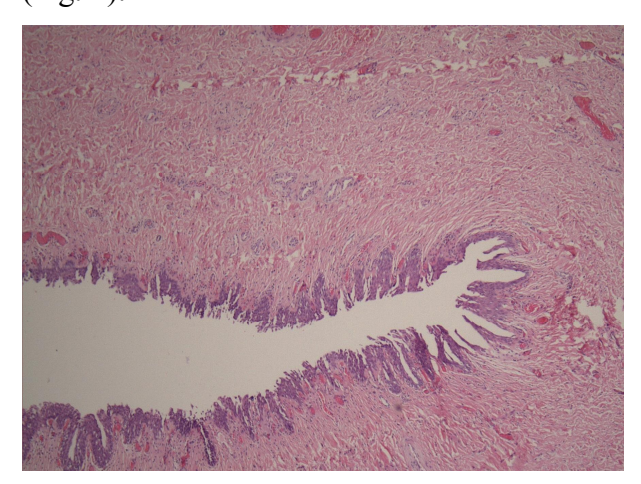
Fig. 4. The histopathology of the diverticulum showed bladder mucosa lined by urothelium with fibrous wall and thin smooth muscle (hematoxylineosin, original magnifications ×100)

The defect of the detrusor muscle was repaired with two layers using 3-0 polyglactin sutures (Vicryl®, Ethicon, Johnson & Johnson, Brussels, Belgium). Bladder indwelling catheter was removed at 5th postoperative day. The patient was discharged uneventfully. Histopathologic examination revealed a thick mucosa lined with urothelium (Fig. 4).