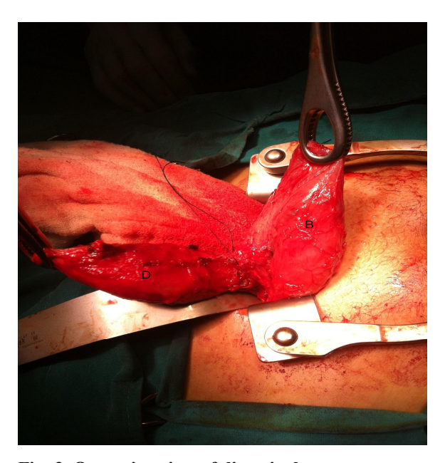
Fig. 3. Operative view of diverticulum (D: Diverticulum, B: Bladder).

An indwelling catheter was placed to bladder, filled with saline, underwent extravesical exploration through the Pfannenstiel incision. narrow neck was found on the posterior wall The diverticulum (7 cm in diameter) with of the bladder (Fig. 3).