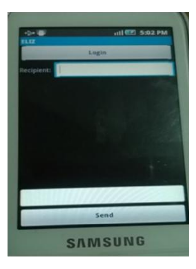
Figure 1. Flow of the application.