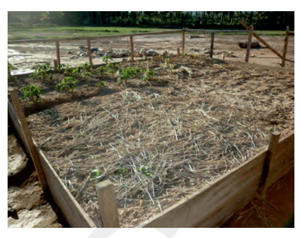
Figure 3. Four spesies growth at cyanidation tailings from ASGM Sekotong, West Lombok, Indonesia.

An early research of gold phytomining in Sekotong of West Lombok District was conducted in 2011. A plot of four different species which were cassava, corn ( Zea mays ), Brassica juncea , and Sunflower directly planted on cyanidation tailing (Figure 3). The Au concentration on the cyanidation tailings was in the range of