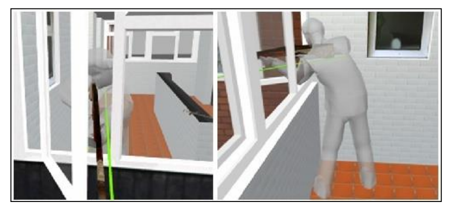
Figure 5 Two Images from a Forensic Animation of a Bullet Trajectory Reconstruction

This example demonstrates how it is now possible to attain photorealistic representations within the virtual environments. The virtual reconstruction shown in Figures 4 and 5 demonstrates how objects in the simulation could be modelled with varying degrees of accuracy to explain and visualise the certainty/believability/veracity of the information related to that object.