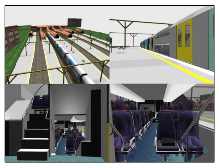
Figure 8 Images from the JIVE Project Terrorism Reconstruction

Since this terrorist case was based on a hypothetical explosion, the reconstruction had to rely on simulation evidence from a forensic scientist. The specific debris patterns, the position and size of the crater and the damage to the train was all modelled based on information from the forensic scientist. If this case were a real case, then the train damage, crater size and debris locations would all have been measured and accurately partially positioned by the police or forensic survey team (Schofield, 2011; Tait, 2007).