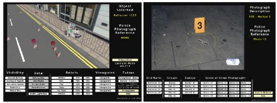
Figure 2 Image from a Virtual Simulation of the Vehicle Debris at the Murder Scene

An interactive crime scene briefing tool was created (Figure 2), with all people and vehicles involved represented in the virtual environment (over sixty moving objects) over a two hour time window. Objects were positioned based on CCTV footage, physical evidence recovered from the scene and witness testimony. The use of a real-time graphics engine allowed the user to view the crime scene and event chronology in an interactive way, updating the virtual evidence as and when new information came to light and to view the scene from many different perspectives (Schofield, 2007; Schofield and Mason, 2012). The final version of this briefing tool was then used in court to aid in the conviction of four men for the shootings (BBC News, 2005).