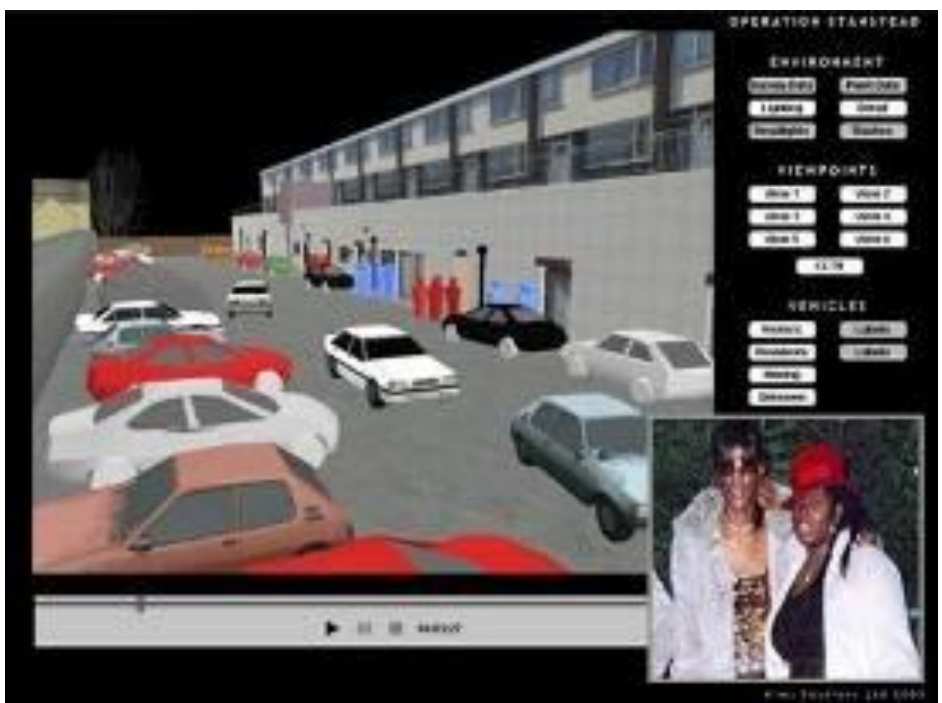
Figure 1 Image from a Virtual Simulation of a Drive By Shooting

The first issue is how to correlate the viewpoint of a witness in a "virtual" environment with the view from their physical position at the scene. For example, compare the "physical world" view of the driver of the vehicle involved in a road traffic accident (such as the one shown in Figure 1) with the field of view of a camera in a virtual reconstruction. In some cases, it may be possible to show views of the incident from the viewpoints of many different parties (victims, witnesses etc.) involved (Noond et al., 2002).