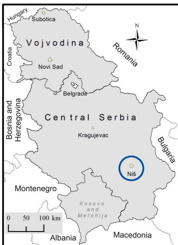
Map 1. Geographical setting of Niš (Authors)

City of Niš is located at Corridor 10, with the main road on the branch line to the south, Thessaloniki and Athens, and the route to the east of Sofia and Istanbul. From Nis roads lead to the northeast, towards Zaječar, Kladovo, Timisoara, and southwest to the Adriatic Sea (Radojević, 2011). Nis airport is very significant for establishing international tourism fluctuation towards tourism destinations in the south and southeast Serbia. Tourism economy could realize significant revenue by offering services to tourists landing on the Nis airport (Stanković & Petrović, 2007). The town itself was formed in the spatial vacuum gravity of large metropolitan centers of Belgrade, Sofia and Skopje (Prodović, 2011).