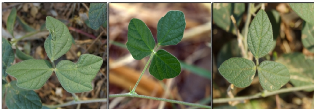
Leaf Morphological Variation in Macroptilium atropurpureum Urb.