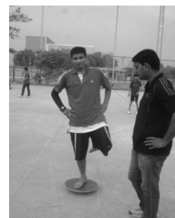
Fig. 2: Single limb stance on wobble board