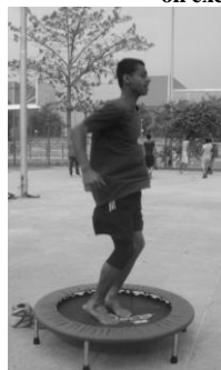
Fig. 4: Jumping on mini trampoline

Statistical Analysis: The mean and standard deviation of all the variables were analysed. Data analysis was done with the help of SPSS for windows version 16.0 in order to verify the investigations of the study. Unpaired t - test was applied to find out whether the improvements in vertical jump height were significant. The significance level set for this study was 95% ( p < 0.05 ).