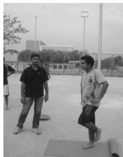
Fig. 3: Single limb stance on exercise mat with eyes closed

Uneven walkway (customized):- the uneven walkway was customized with help of tennis balls as a station of multi station training to experience different surfaces in walking.