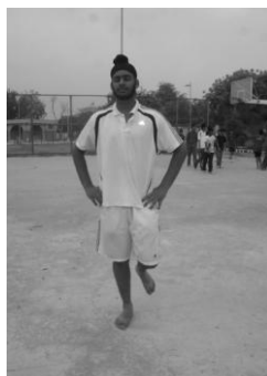
Fig. 1: Single limb stance with eyes closed