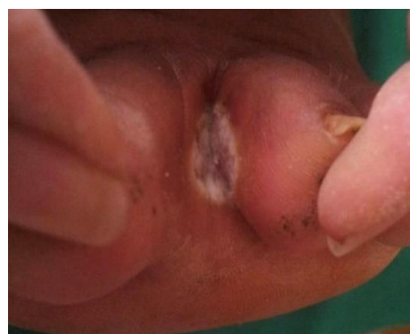
Fig. 2: 5 th Toe web space