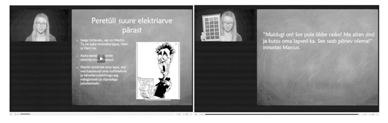
Figure 2: An example of the scenario ( in Estonian ).

In order to test the instrument, a scenario aiming to be relevant, interesting and enjoyable, was developed. The contexts for the scenario, chosen from the fields of EU strategic priorities (European Commission, 2010), in this case – renewable energy sources, was a story of a family, in which the father was concerned about increases in the monthly electricity bill. He blamed his teenage children, who were constantly using their smart devices. In trying to find a solution, he was thinking about installing solar panels on the roof of his house. Thus, in order to find out whether solar panels were beneficial for his household, he contacted a friend, who was an electrical engineer. During the scenario two other occupations- environmental protection specialist and materials scientist- were introduced, providing information about the responsibilities and competences needed for those occupations. The scenario, presented in a video format (Figure 2), was 11 minutes long and ended with a suggested solution by trying to make small solar panels to charge smartphones in a sustainable way. Students evaluated the scenario with the questionnaire directly after seeing it and it took approximately 10-15 minutes to complete.