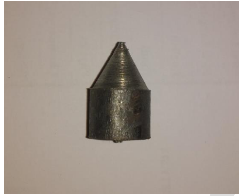
Figure No.4: Spine