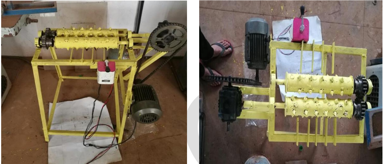
Figure No.5: Experimental setup