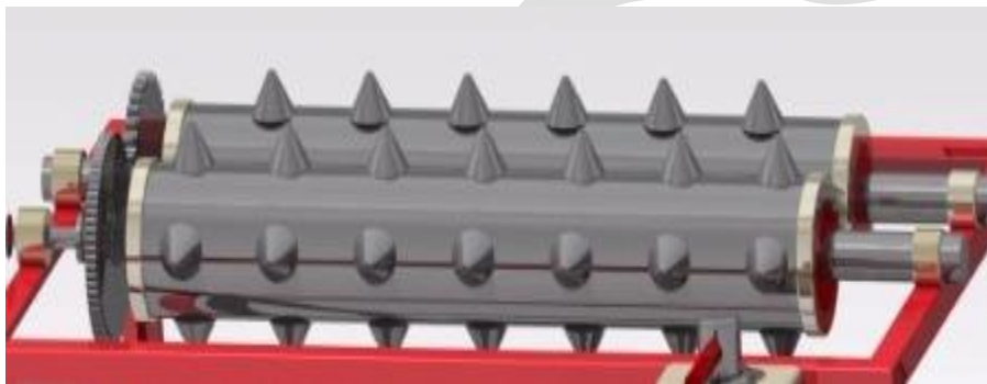
Figure No.3: Roller with Spines