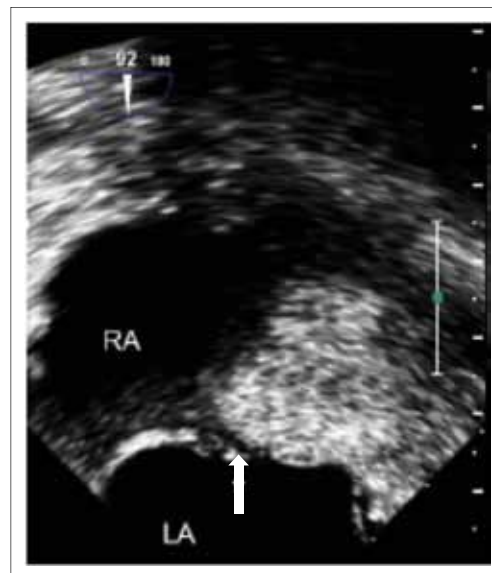
Fig 2. Transesophageal echocardiogram of a patent foramen ovale (arrow). LA = left atrium, RV = right atrium

Patent foramen ovale may be detected by transthoracic echocardiography (TTE), transesophageal echocardiography (TEE) (Fig 2), 5 transcranial Doppler (TCD), and sometimes by transmitral Doppler. These techniques have been compared in studies of proven embolic stroke. One study revealed that TEE detected PFO with the most sensitivity, showing the prevalence of 39%. In this study, TTE found PFO in 18% and TCD found 27%. 11 All PFO detected by TTE and TCD were also detected by TEE. Six PFO that could not be detected by TCD were < 2 mm in size by TEE, implying that TCD may miss small defects. Patent foramen ovale detection can be augmented by cough or releasing a sustained Valsalva maneuver. It opens the foramen when the right atrium fills with blood from the abdomen, while the left atrium is volume depleted prior to blood passing through the pulmonary circulation. This maneuver is now considered necessary to find right-to-left