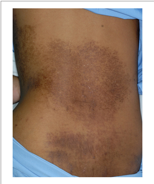
Fig 1. Discrete brownish papules which become confluent to form a reticulate pattern on the back.

ratory examinations showed leukocytosis with anemia (WBC 14,510/mm 3 , N 75%, L 13%, M 6%, E 5%, platelets 447,000/mm 3 and hematocrit 26.8%), high serum ferritin level of 3,852 ng/ml and high lactate dehydrogenase (LDH) level of 2,570 U/L. The liver function showed mild elevation of liver enzymes (AST 62 U/L and ALT 115 U/L). Serum creatinine, urinalysis, and chest x-ray were normal. Antinuclear antibody (ANA) and rheumatoid factor (RF) were negative. Lesional biopsy from the abdomen revealed mild epidermal acanthosis with focal spongiosis and exocytosis of neutrophils. There were scattered dyskeratotic cells in all layers of the epidermis and focal vacuolar degenerations of basal cells were noted (Fig 2). There were superficial perivascular and interstitial infiltrates of lymphocytes, neutrophils, eosinophils and nuclear dusts without evidence of endothelial damage (Fig 3). Direct immunofluorescent study from the tissue biopsy revealed negative finding. After intensive investigation, there was no evidence of infections or malignancies, and the patient was finally diagnosed with ASOD. The patient was initially treated with oral prednisolone 40 mg/day. The skin eruption gradually disappeared soon after the initiation of