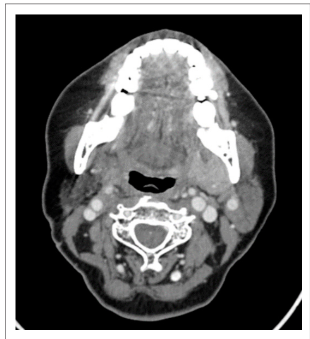
Fig 3. Computed Tomography after Radiotherapy 60 months.

For her carotid body tumor, by the fifth year her follow-up CT scan showed soft tissue density without enhancement about 0.5x1.0 cm. in the original area of tumor as shown on Fig 3. By such non-enhancing unremarkable findings, it may be confidentially interpreted as complete remission. In addition, she had no moderate or severe radiation toxicities from radiation treatment at all.