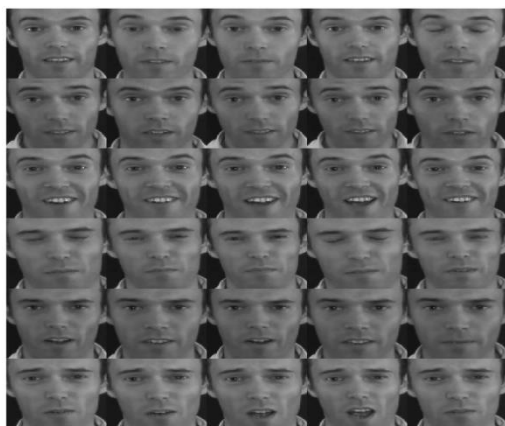
Fig. 3 Facial Expression Images In the Video of s1_ha_1