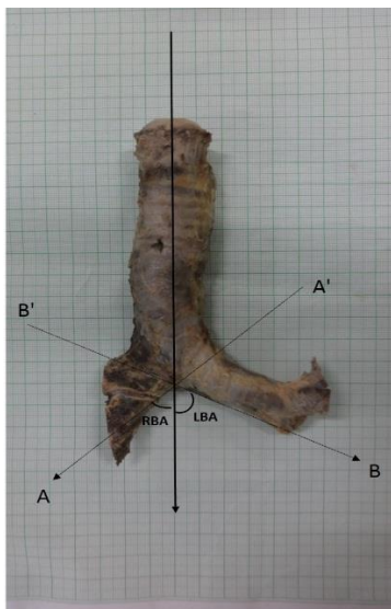
Fig. 1: Showing the tracheobronchial angle. RBA-Right bronchial angle, LBA-Left bronchial angle Subcarinal angle (SCA) = RBA+LBA

cross sectional shapes of tracheal opening were recorded following the description given by Mehta and Myat. (2)