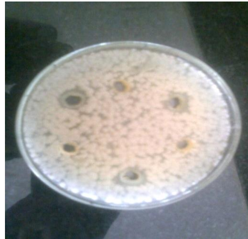
Figure 3: Antimicrobial activity of Butea monosperma extract against proteus vulgaris