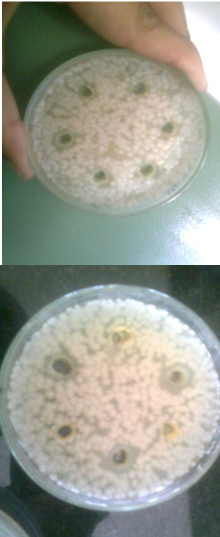
Figure 1: Antimicrobial activity of Butea monosperma extract against E. coli .