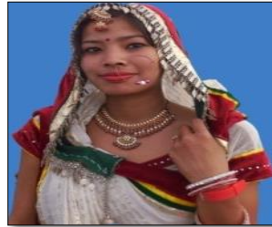
Figure 1(a): Ghunghat (forehead)