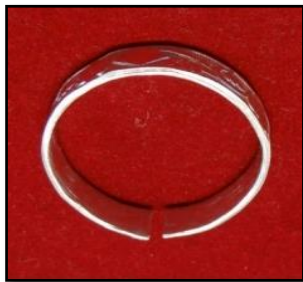
Figure 2(h) Challa (fingers)