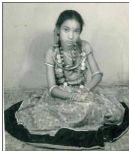
Figure 1(g): Bara and Hasuli (Hand and neck)