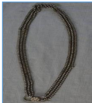
Figure 2 (b) Sankar (neck)