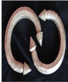
Figure 1(f): Khaduva (hand)