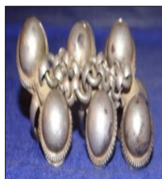
Figure 1(m): Dagade