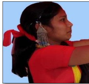
Figure 1(b): Karputiya (ear)