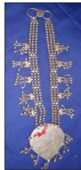
Figure 1(c): Pooj (neck)