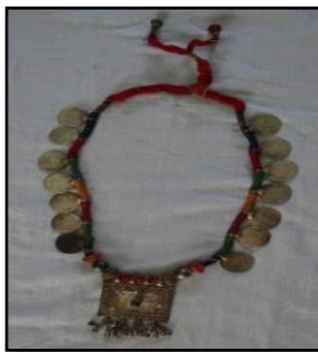
Figure 2(a) Halem (neck)

Men wore very few ornaments. Commonly ring or challa in fingers and kundal in the ears were used. Both were made form silver metal. This jewellery was only owned by the people with comparatively economically stable status.