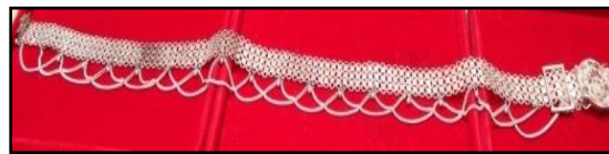
Figure 2(i) Kardhani (waist)