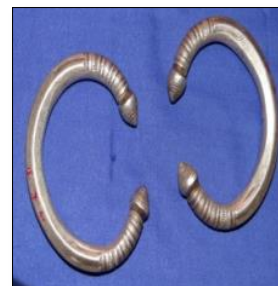
Figure 1(l): Bankada