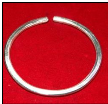
Figure 2(d) Kharua (wrist)