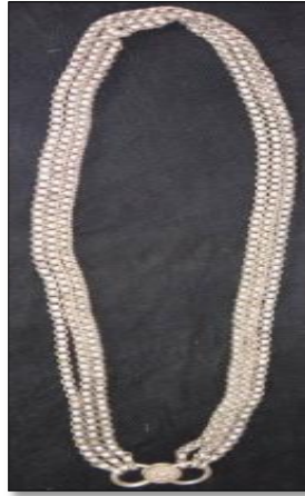
Figure 1(e): Sakai (neck)