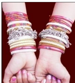
Figure 1(i): Parichan