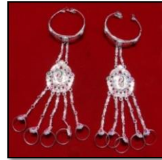
Figure 2(e) Bazuchak (wrist) Figure 2(f) Paribhand (wrist) (hand) Figure 2(g) Hath phool