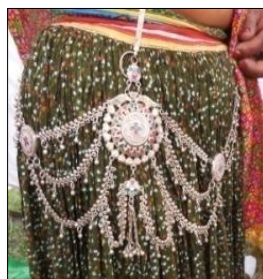
Figure 1(k): Kaidhuni