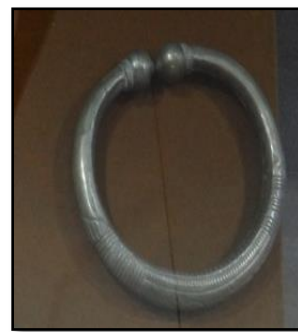
Figure 2(c) Khaila (wrist)