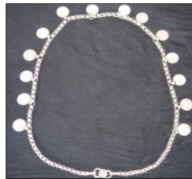
Figure 1(d): Dulari (neck)