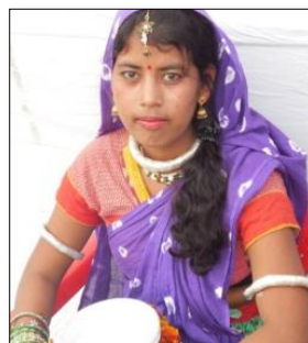
Figure 1(h): Bank