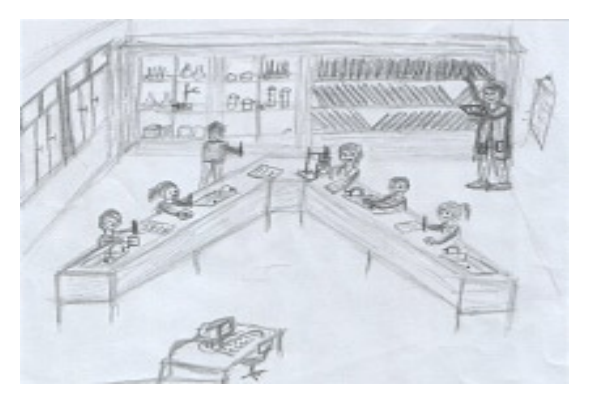
(e) Students investigate the questions by using books and experiment tools in the classroom. Teacher guides them.