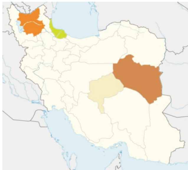
Figure 1. The areas of study including East Azerbaijan, Gilan, Yazd and South Khorasan Provinces marked on the map of Iran as orange, green, cream and brown respectively.

hot and dry climate in sand dunes region) and East Azerbaijan Provinces (cool and dry climate in mountainous region) in Iran (Figure 1). The sampling period commenced in January 2011 and ended in December 2011. Sampling was undertaken in different types of livestock found in stables situated in randomly chosen villages.