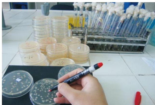
Figure 2. Colonies counting in the Ames test.

Under these experiments, the comparative mutagenicity effect was seen in 1.5 mg/plate by the bacterial reverse mutation assay in S. typhimurium TA98 strains, without S9 and the excellent antimutagenicity effect was seen in 1.5 mg/plate against S. typhimurium TA100, without S9. In other words, A. absinthium oil had significant antimutagenic activity against sodium azide in the TA100 strain without S9.