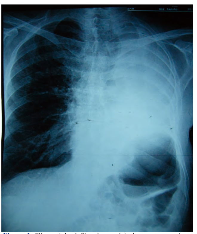
Figure 1. Fibronodular infiltration at right lower zone on chest X-ray.

Sulbactam ampicilline is started with the working diagnosis of pneumonia. On the 4th day of treatment, the fever was still continuing. Fibronodular infiltration was seen in right lower zone of chest X—ray (Figure 1).