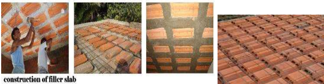
construction of filler slab