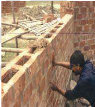
Fig 1:Rat-trap bond wall

The air medium created between the brick layers helps in maintaining a good thermal comfort inside the building. This phenomenon is particularly helpful for the tropical climate of South Asian and other countries.