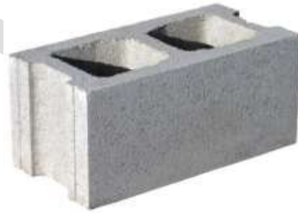
Fig 3: Concrete block walling