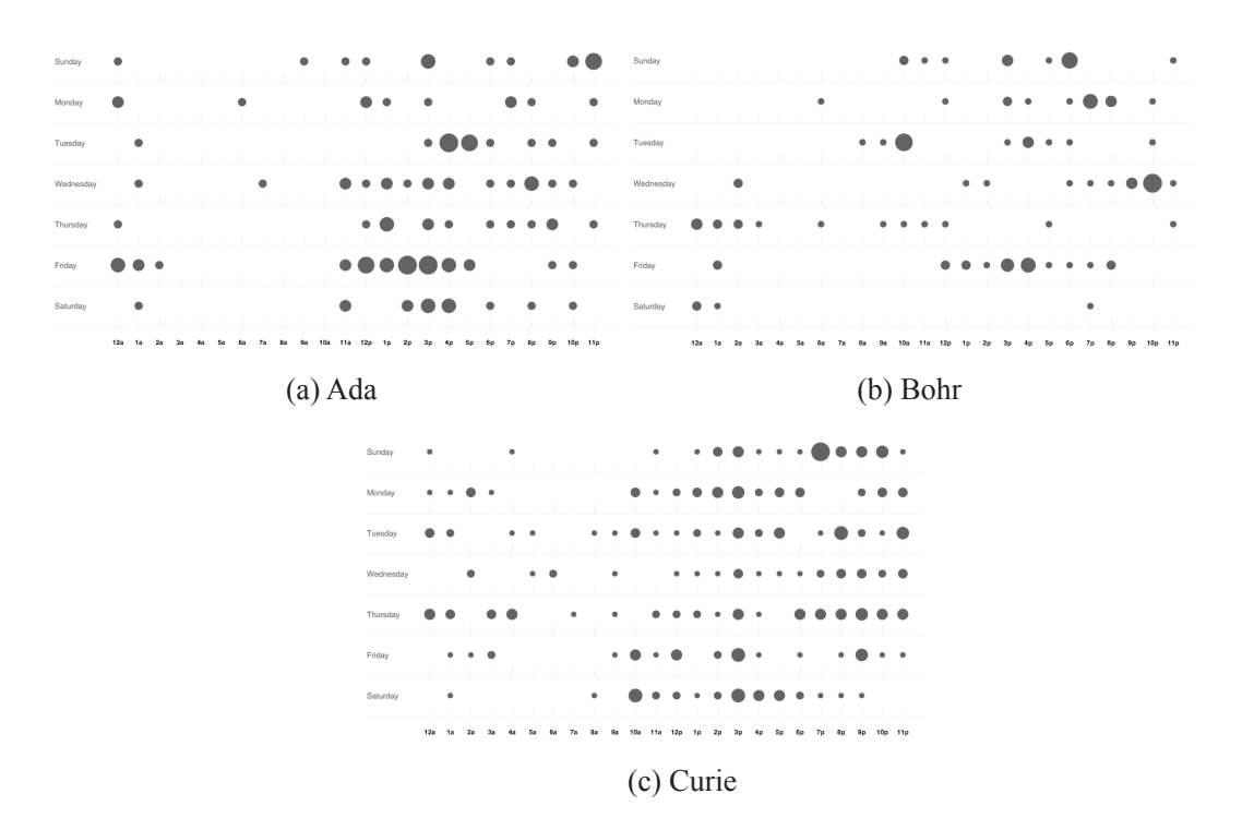
Figure 1: Comparison of work distribution for three teams. Each row is a day of the week; each column is an hour during the day. The size of each circle represents a normalized view of work submitted during the day and hour combination.

While a total of 11 quantifiable metrics were collected, four were based on the researchers' observations, while the remaining seven were collected through the cloud based collaboration tool. The four metrics collected "by-hand" are the ones that would typically be used to gauge communication and focus on meeting frequency and team engagement. The tool allowed the researcher to capture seven quantifiable metrics surrounding communication without any inference, bias or intrusion into the team dynamics. The captured metric ranged from the number of discussions (email, online and total); the average length of each discussion – as measured by the number of responses; how work was distributed based on day of the week and time of day; what the work frequency of the group appeared to be over time; and finally, whether or not the team took advantage of collaborative features within the online tool. In order to quantify the work distribution and work overtime, the researcher used the charts shown in Figure 1 to classify work distribution as either evenly spread over time (Ada and Curie) or unevenly (Bohr). More specifically, note that the Ada and Curie teams have an evenly distributed work schedule across all days afternoon and into early morning, while the Bohr team has a wider variance of submitted work. Figure 2 shows the charts used by the researcher to quantify the pattern of work as increasing (Ada and Curie) or decreasing (Bohr).