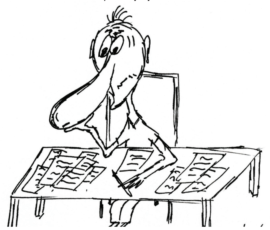
Figure 2: Drawing by a female respondent, age 18. Author's description: Thinking scientist.