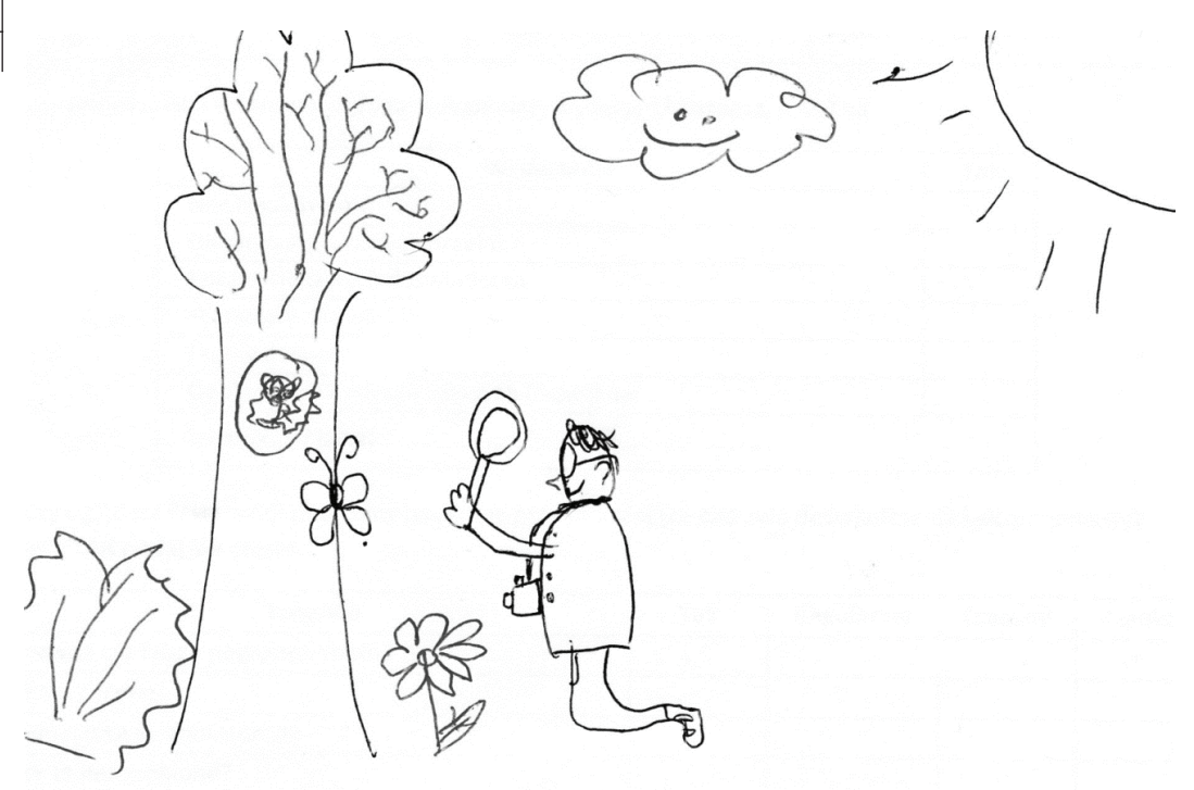
Figure 3: Drawing by a male respondent, age 17. Author's description: A scientist working outdoors.