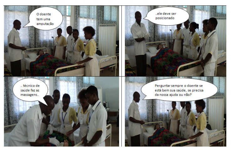
Figure 3: Photonovel produced in Beira city - Sofala' Province in Mozambique (Amputee costumer).

In Figure 3, it is possible to see some instructions recommended to apply to victims of amputee, in a region of the country where there are still many people who are victims of land mines from the civil war period. So, in this centre it is an important issue to prepare health professionals that will be faced with this situation in hospitals. For these students, from the younger generation that were born after the war, it is important to know how to deal with this situation and offer a humane treatment for these patients that were war victims, and respecting them.