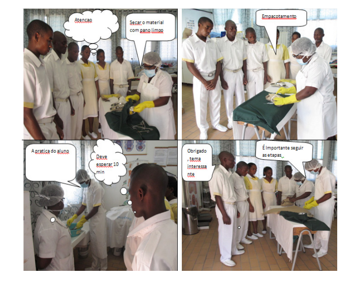
Figure 4: Photonovel produced in Beira city - Sofala' Province in Mozambique (medical instruments manipulation).

PROBLEMS OF EDUCATION IN THE 21<sup>st</sup> CENTURY Volume 60, 2014