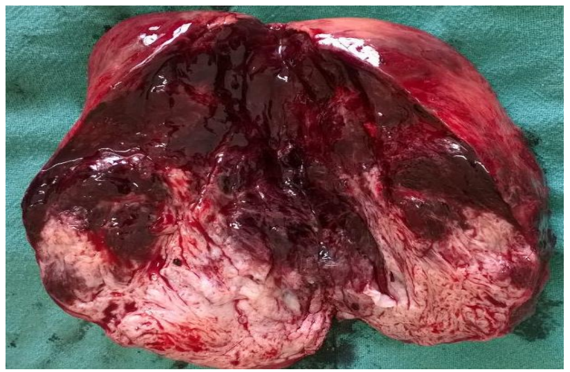
Figure no 3: cut section of fibroid showing degenerative changes