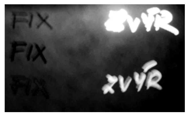
Figure 3. Felt pens (left) and highlight pens (right) under the UV lamp.

Students get acquainted with the principle of UV fluorescence and different forms of its utilization – protecting elements of banknotes and documents, whitening agents in washing powders, highlight pens vs. felt pens or fluorescent pigments of plants and vitamin B_2 .