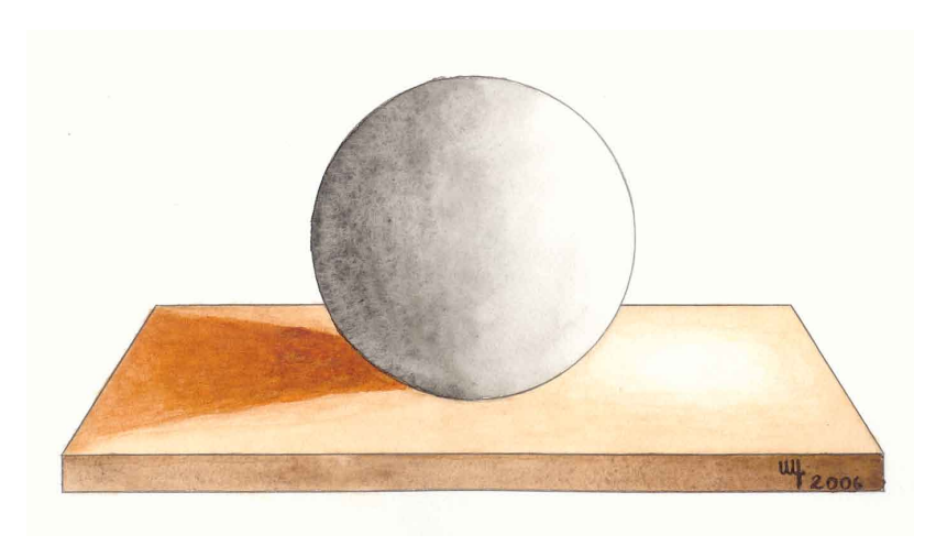
Figure 2. Researchers' reflections on phenomena are always limited by what is focused upon. The aspects described are those which are focused upon, leaving the unfocused aspects in the shadow of the phenomenon itself.