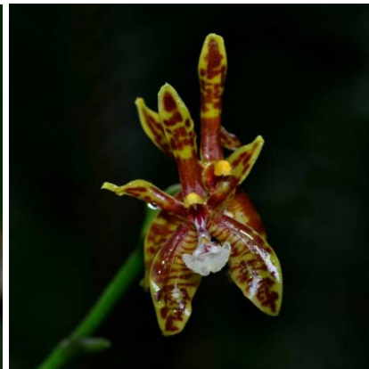
Fig. 3: Phalaenopsis mannii

Epiphytic. Stems stout, 1.5–7 cm, 4 to 5 leaved. Leaves oblong-oblancheolate, 20–23 × 5–6 cm, base cuneate, apex acute. Inflorescences 1 or 2, ascending or pendulous, 5.5–30 cm, unbranched or sometimes branched, many flowered. Flowers opening widely, long-lasting, thickly textured, waxy, glossy, sepals and petals yellow with dark brown spots and bars, lip mid-lobe white, column yellow. Dorsal sepal obovate-lanceolate, 15–18 × 5–7 mm, acute; lateral sepals obliquely ovate-elliptic, 15–18 × 7–9 mm, acute. Petals suboblong, 13–15 × 4–5 mm, acute. Lip 1 cm, base with a claw, 3-lobed; lateral lobes erect, pressed, oblong-subquadrate, 4 × 2 mm, obliquely truncate; mid-lobe transverse, anchor-shaped, margin fimbriate-erose, apex a swollen knob with sparse trichomes. Column 8 mm, foot 4 mm.