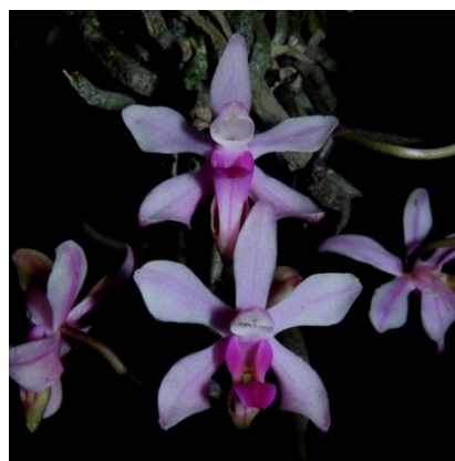
Fig. 5: Phalaenopsis taenialis .