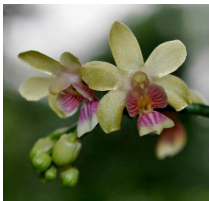
Fig. 1: Phalaenopsis deliciosa .