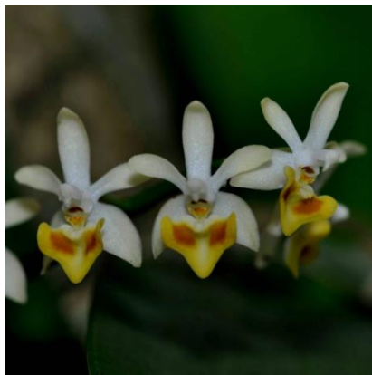
Fig. 2: Phalaenopsis lobbii